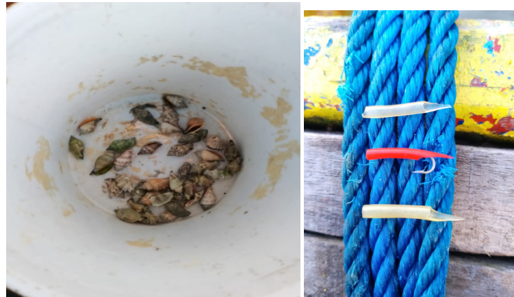
Figure 1. Beetle bait ( Gastropoda ) and Rubber nipple bait (artificial bait) which is used to catch pompano fish fry