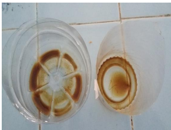
Figure 2. Rhizophora mucronata Mangrove Leaves Infusion Extract

To prepare the infusion, 2 grams of the mangrove leaf powder were brewed with 100 mL of boiling distilled water (100 °C). The mixture was then filtered to separate the infusion extract from any debris. Following filtration, the infusion extract was concentrated using a rotary vacuum evaporator and subsequently dried using a freeze-dryer (Figure 2).