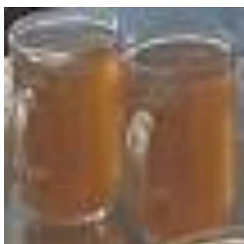
Figure 5. Rhizophora mucronata Mangrove Leaf Tea Infusion

Figure 4 shows how panelists rated somewhat, such as the appearance (color) and aroma of R. mucronata mangrove leaf tea infusion. Statistical analysis showed no difference ( F > 0.05 ) in assessing the appearance and aroma of R. mucronata mangrove leaf tea infusion between oven-dried and sun-dried. The appearance (color) of R. mucronata mangrove leaf tea infusion can be seen in Figure 5.