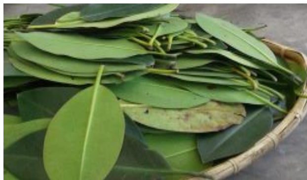
Figure 1. Mangrove leaves of Rizhophora mucronata

Rizhophora mucronata mangrove leaves were obtained from the coast of Palu Bay (Figure 1). The mangrove leaves obtained were at the top and had a soft texture. After that, mangrove leaves are washed using clean water and separated from the leaf bones. The leaves separated from the leaf bones are soaked using clean water for 48-60 hours, and every 4-6 hours, water is changed. After that, boiling is done with 5% whiting water solution for 15 minutes at 100 °C. Then, rinsing is done with running water until the rinse water becomes clear again.