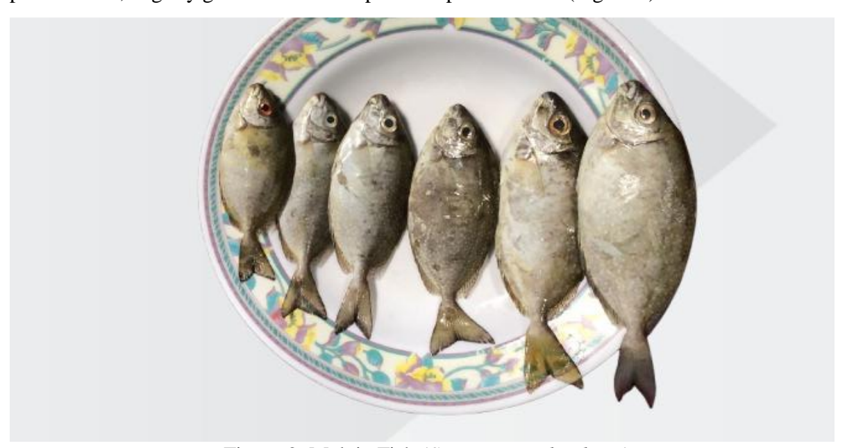
Figure 2. Malaja Fish (Siganus canaliculatus)

Malaja fish is a herbivorous fish that lives in groups and is often found in seagrass beds and coral reefs. This fish has a body part that is silver gray on the upper part while the lower part is silver, slightly greenish on the nape and top of the head (Figure 2).